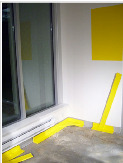
Avantika Bawa. yesterday, Yellow. installation view.

Minimalism's tactics including Andre's use of the floor, McCracken's leaning planks, and the widespread use of seriality are reinvigorated in the project of casting a critical eye on the life (and death and rebirth) of the manufactured good and what it says about where we are and where we're going...something that Bawa here casts in a hopeful light, a bright yellow one, not least because in the opposite corner of the space, tucked into the corner, it appears that building anew has begun.